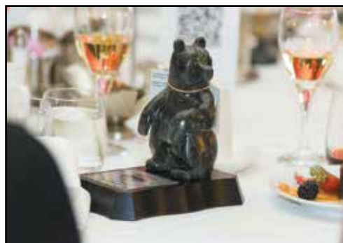
"Commemorative Ontario Sports Hall of Fame Awards"

FOR SPONSORSHIP OPPORTUNITIES AND TABLE SALES PLEASE ACCESS OUR WEBSITE OR CALL www.ontariosportshalloffame.com | 647.204.9020 | email: yyzamis@gmail.com